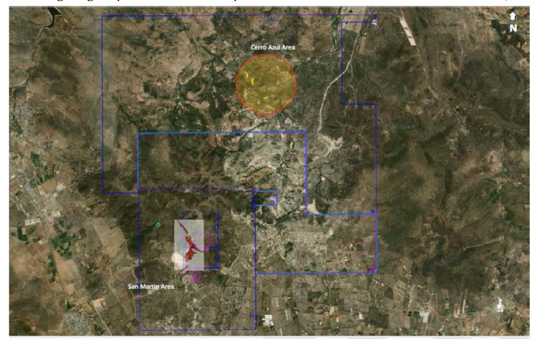
Fig 3) Claim Map representing Cerro Azul Area.

b. To confirm the geological potential of the north part of the concessions in the areas of Cerro Azul (North Area)