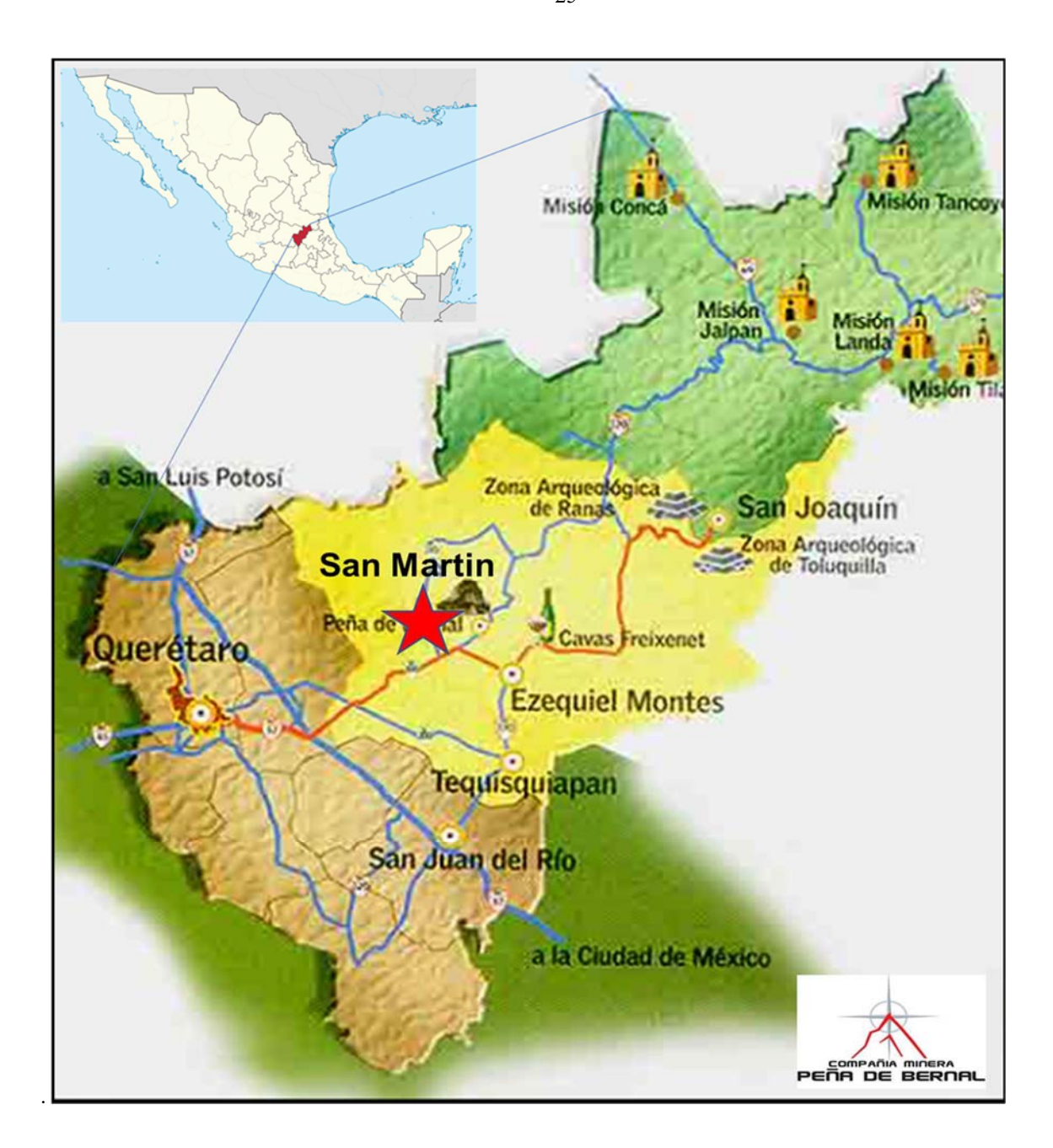
The following table summarizes the mining concessions comprising the San Martin Mine property.